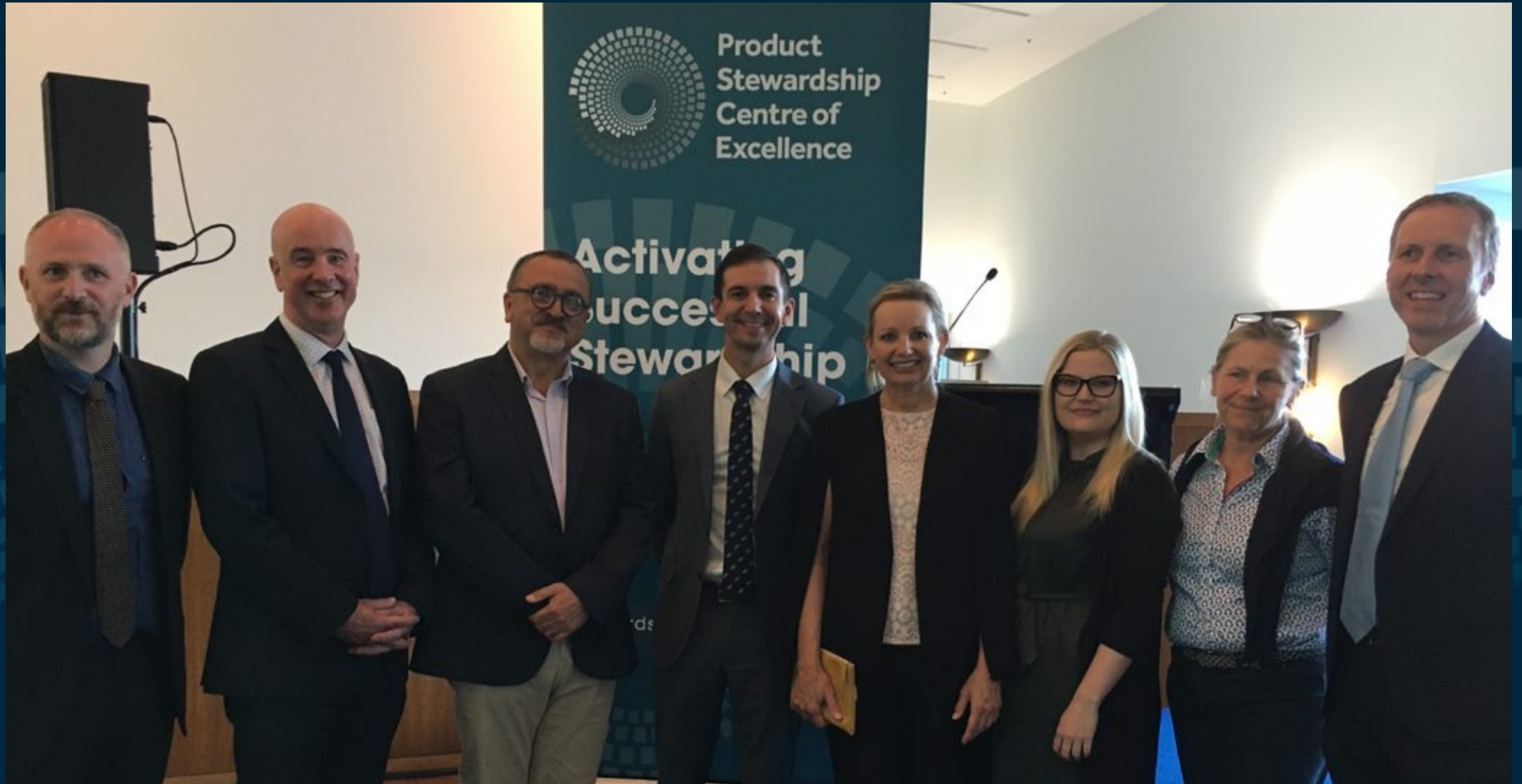
Centre of Excellence Launch at Parliament House, Canberra, 15 March 2021